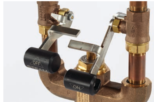
Interlocking handles for safer operation